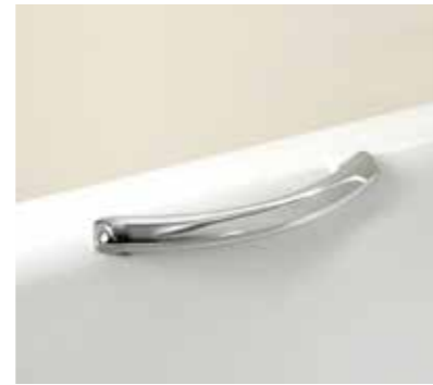
Above: Stylish handgrip option on all Delta / Sigma models.

Although exquisitely designed, the Delta / Sigma range has its roots in flexibility. Perfectly proportioned, the Delta family complements a range of bathroom styles and layouts.