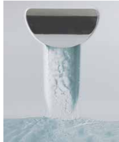
Above: Unique integrated filler available on the Echelon bath.

The Echelon / Equity range has all the design features needed to turn these baths into modern classics, allowing them to hold their own in highly styled bathrooms. Don't think, however, that the Echelon / Equity range is form over function. Warm, smooth curves allow design and comfort to go hand in hand.