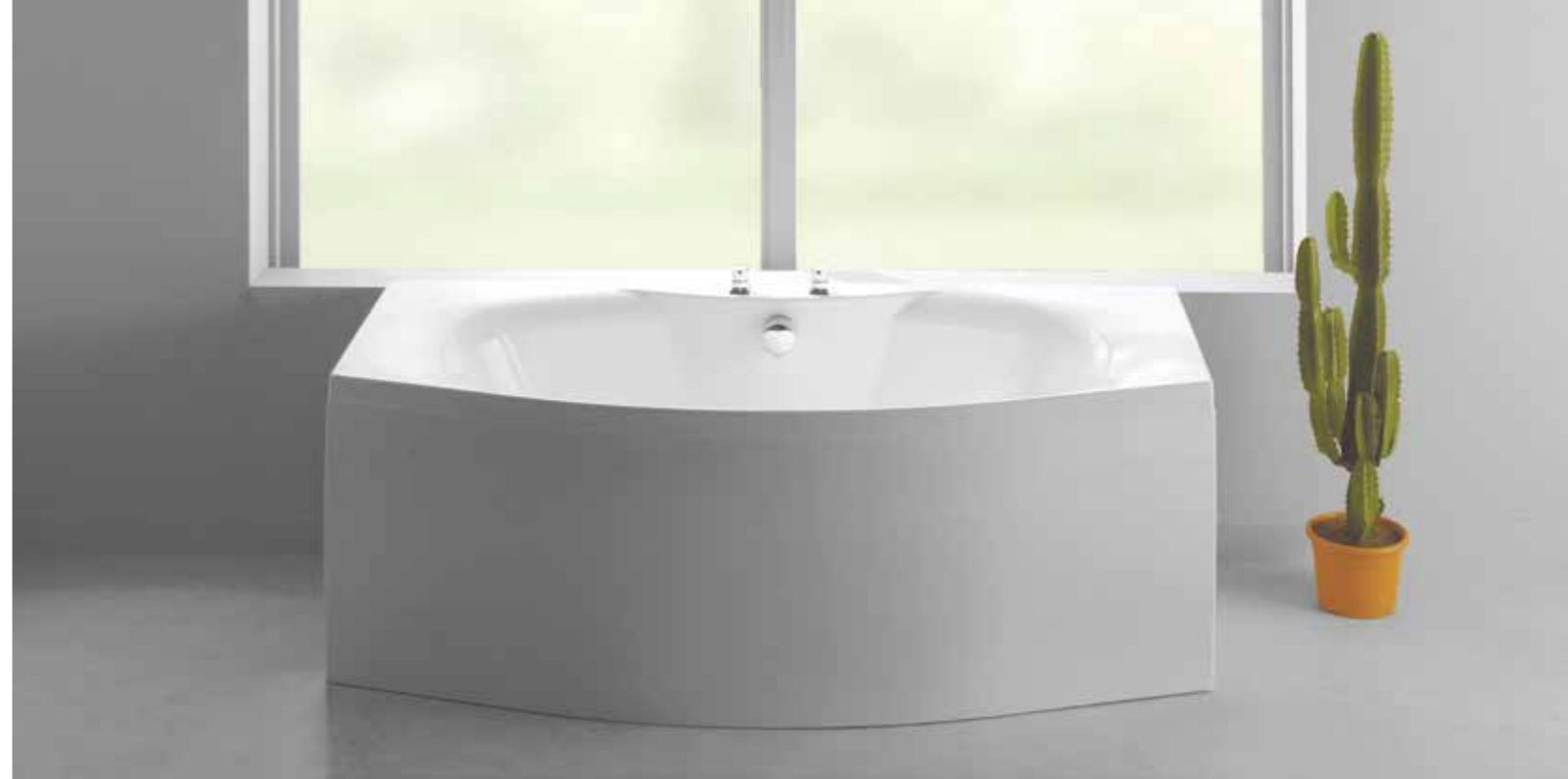
Right: The Mistral bath is the deepest bath in our Duo range.

The clean, symmetrical design of our duo baths mean that not only do you have a beautiful piece of design in your bathroom, it can be appreciated by two people at once. Contemporary but understated, our duo baths add subtle elegance to your new sanctuary.