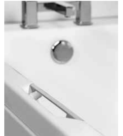
Designed with an integral grip to allow the use of a shower screen.