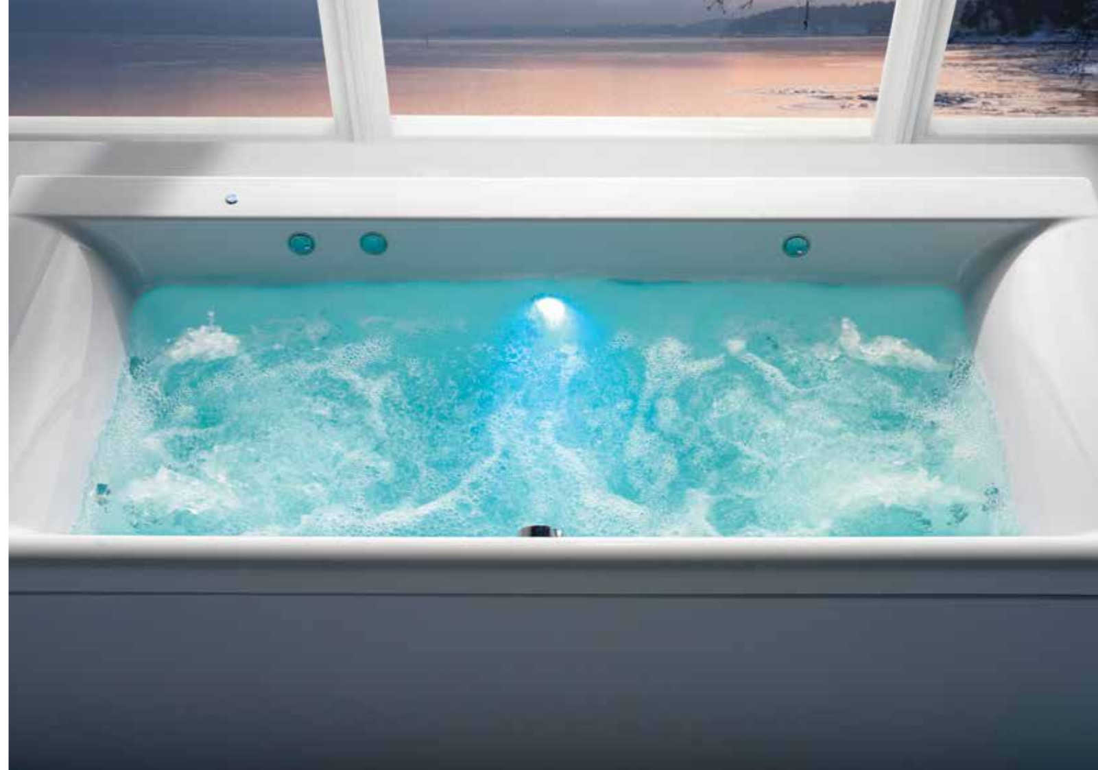
Right: Haiku with C-Lenda system 3 (includes chromatherapy).

The C-Lenda Whirlpool system is the most technologically advanced system available on today's market. This unique jet system has been designed by Markon in New Zealand and ensures the most comfortable bathing experience. Almost all baths in the Carron range are compatible with this whirlpool system and are made to order by our skilled technicians at our factory in Falkirk.