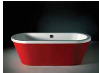
Top: Halcyon models available in black, white and red finish.