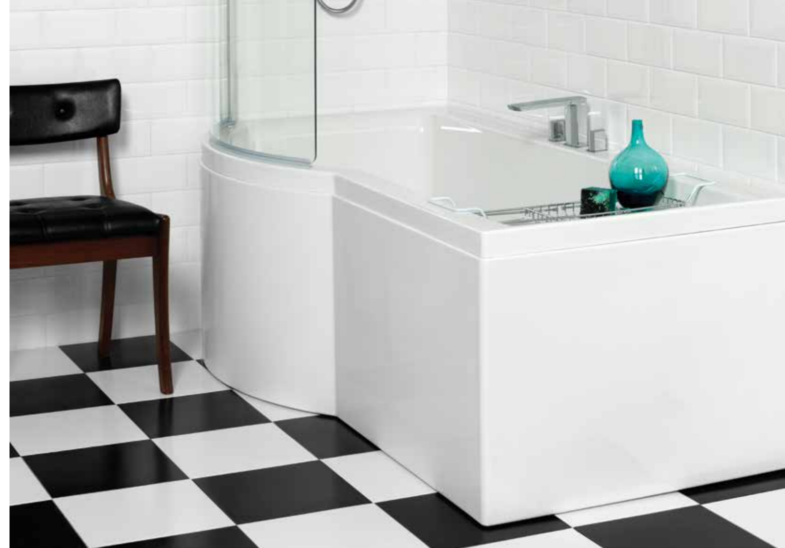
Right: The Urban Showerbath fits perfectly with retro styled subway tiles for the ultimate urban look.