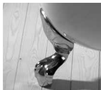
Top: Ascoli. Chrome feet available with the Ascoli Freestanding bath only. Right: Elysee Freestanding bath.

The Carron range of freestanding baths are modern but retain a classic feel. The Elysee, Ascoli and Paradigm baths will make a lasting impression in any bathroom.