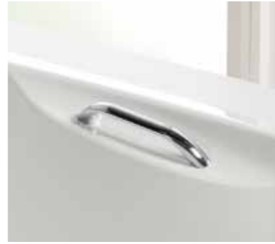
Right: Imperial range comes with chrome grips as standard.

While Imperial measurements may be a thing of the past, sizes available in this range provide a solution to the problem of replacing a bath in an existing space.