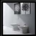
CS6017 550x380x400-56P-Trap Patent No.200730136268.9 DT9017 550x380x400