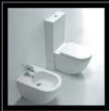
CS4010E 715x405x955&P-Tragl DT5010 570x350x400