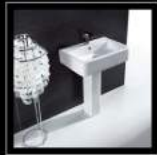
BP1009A 500x450x850 BP1009B 700x480x850 BP1009C 900x480x850