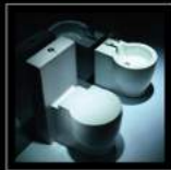
DW601 655x465x795(58P-Trap) DT9802 545x408x195