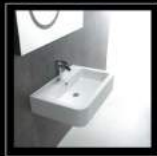
BA1089B 700x480x160 Patent No. 200930342734.8