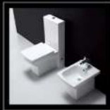
CS60178 695x418x955(567)-Tregl DT9017 550x380x400