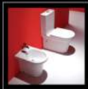
C36022A 680x360x860C&P-Trap DT9022 540x360x410