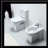
CW8015 655x365x780/58F-Trap CW8015B 655x365x780/5-Trap DT9004 550x355x400