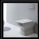
CS6017 550x380x400-56P-Trap Patent No.200730136268.9