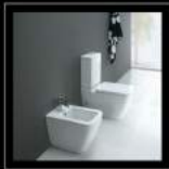
CS6303A 650x340x880(S5P)-Trap1 Patent No. 200830192759.1 DT9009 530x340x410