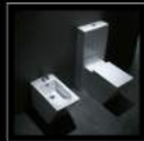
CS6011B 715x485x590/58P-Trap) Patent No. 200530076683.5 DT9011 570x300x400