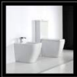
C160198 575x485x950 (S&P-Trap) DT5009 510x366x410