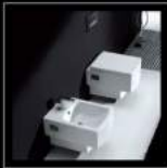
CS0026 525x380x345 Patent No. 201030178301.2 DT9026 525x380x345