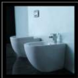
CS6010 570x350x400(S&P-Trap) Patent No. 200610063170.0 DT9010 570x350x400