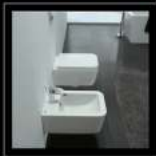
C36029 530x340x345 Patent No. 200830193692.X DT9029 530x340x230