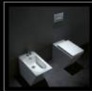
CS6011 570x300x400/58P-Trap) Patent No. 200630063169.8 DT9011 570x300x400