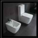
CW8009 628x380x880 G-Trap DT9009 538x380x410