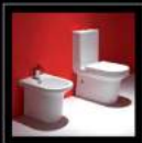
CW8022 680x360x850C-Trap DT9022 540x360x410