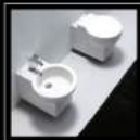
CS6028 535x400x330 DTM001 535x400x350