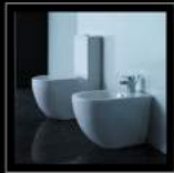
CW8010 680x350x800(S-Trap) DT9010 570x350x400