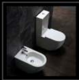
CS6607A 690x350x800x55P-Trap Parent No.200430064305.0 DT9610 170x250x400