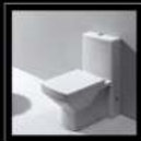
CW8017 695x395x605-56P-Trap CW8017B 695x395x605-56P-Trap